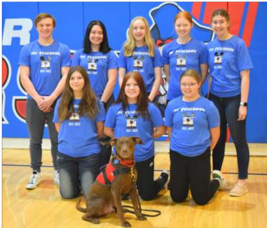
Members of the yearbook committee pose with “Rio”.

SDA has three inmate Canine Assistance Programs at correctional facilities throughout North Dakota. There are also dog fostering and volunteer opportunities throughout the year. As a small, rural nonprofit, SDA relies on supporters to meet their mission. There are many ways to contribute. Please consider supporting SDA to help them continue their work